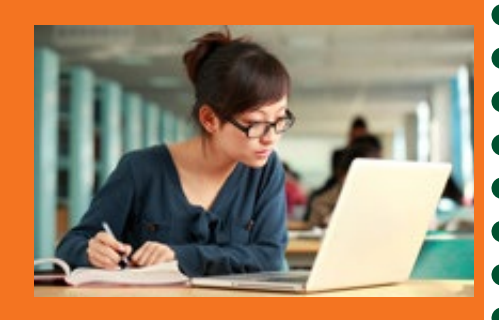
Course term is Aug. 1st - Dec. 16th